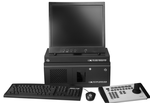
(THE KBD300A IS NOT INCLUDED.)