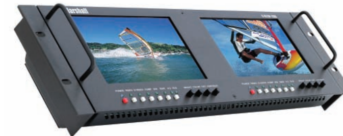
V-R72P-2HD Users Guide

1910 East Maple Ave. El Segundo, CA 90245 Tel.: 800-800-6608 • Fax: 310-333-0688 www.LCDRacks.com Email: sales@lcdracks.com